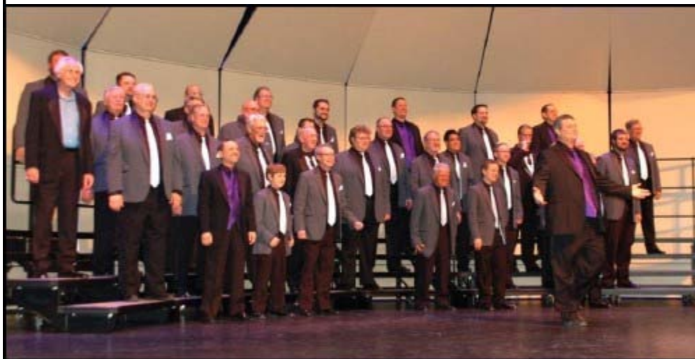
Grand Rapids GREAT LAKES CHORUS, 2014 District Chorus Champions.

Senior Quartet Champion – BUCKET LIST (65.8%). OLD RULES and CLASSIC FIT were second and third.