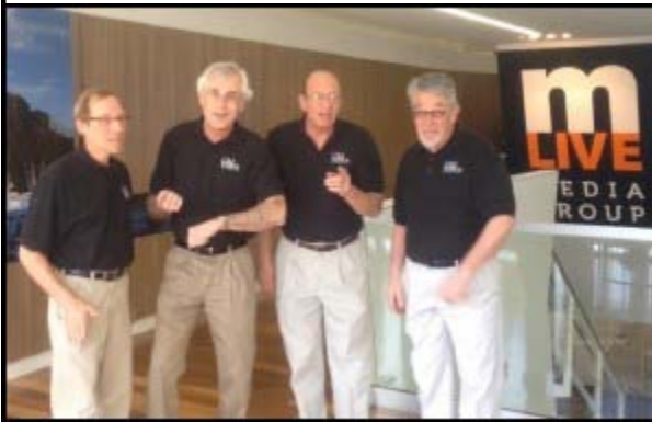
OLD RULES at MLive Media Group