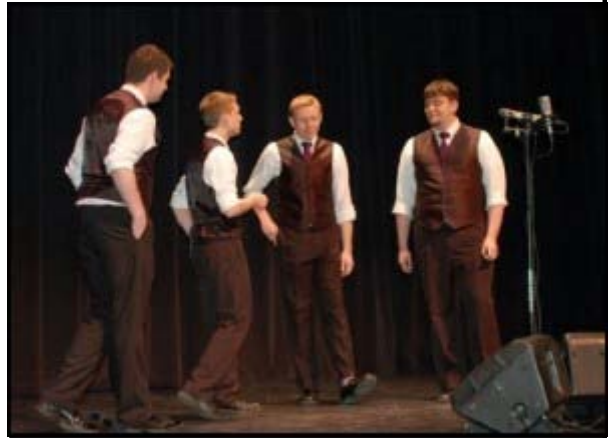
G-FOURS, 2014 District Collegiate Champions.

Collegiate Quartet Champion and Rep to next summer's International convention – G-FOURS was the only quartet in the Collegiate Quartet contest, but their score of 74.3