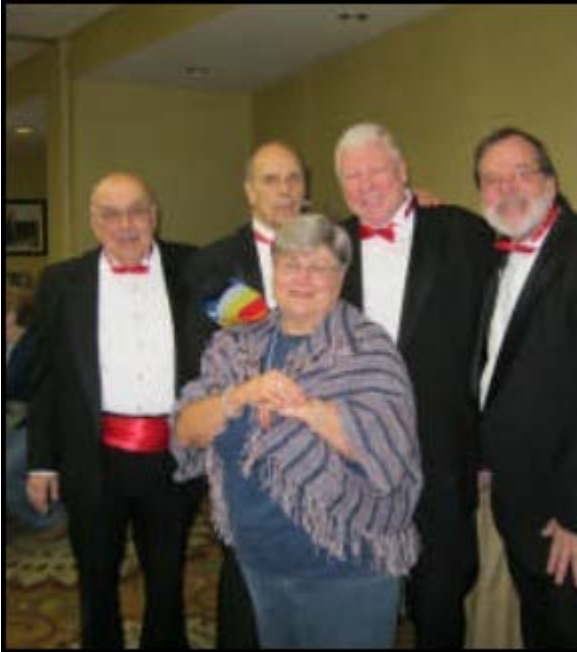
PATCH CHORDS at The Crossroad Weavers Guild in Okemos.