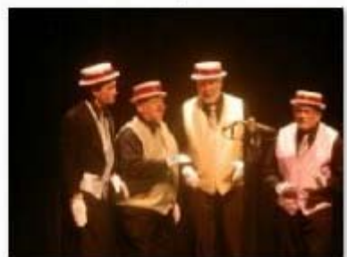
Olde Thyme Harmony Quartet