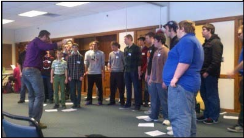
THE VOICE rehearsing Feb 2.

Keep informed at https://www.facebook.com/groups/1425072894387733/permalink/1493429617552060/ .