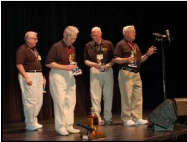
BUCKET LIST, 2014 District Senior Champions.

would probably have been a winner anyway. It sure was with the audience.