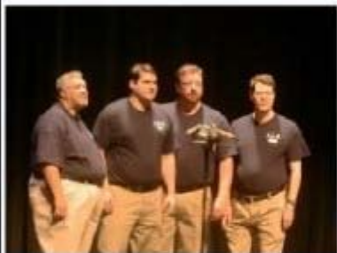
Detroit Sound Machine