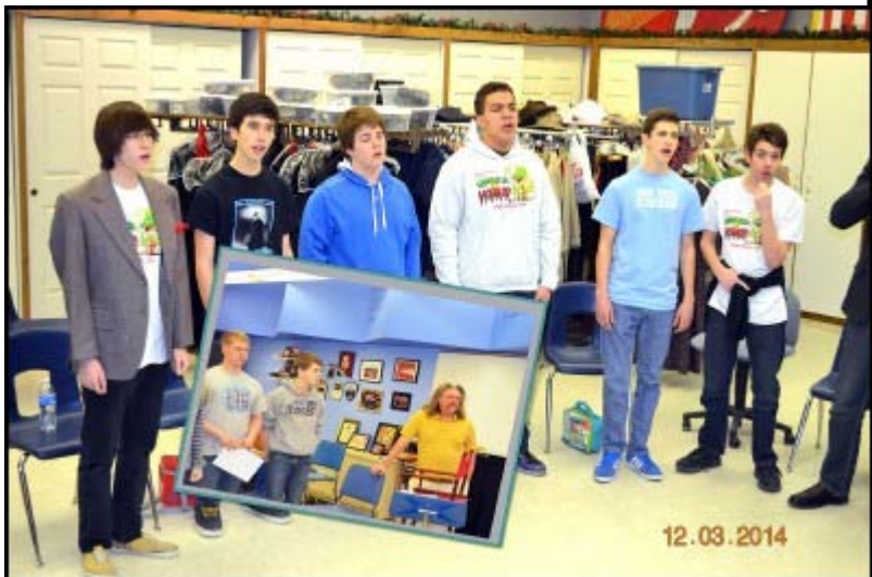
Men's chorus at Garber High School.