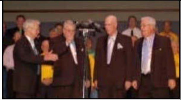
BUCKET LIST at Mid-winter in Long Beach.

Although we didn't make a great impression on stage, we did leave an impression on the Long Beach convention. Lots of attendees carried "Bucket Lists" (with the #1 item filled in for them already), and lots of people were wearing Bucket List Buttons, even some waiters and waitresses, thanks to Johnny Wearing .