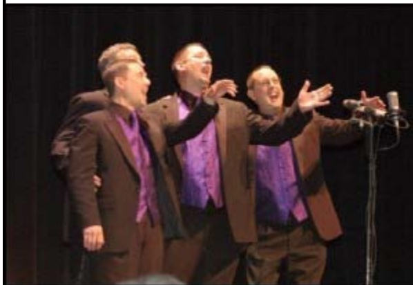
MAJESTYX, 2014 International Reps.

Quartet Champion and Representative to this summer's International convention – MAJESTYX (75.7%). They sang "Forgive Me" and "Fit as a Fiddle" in the Semi's, and "There's a Rainbow Round my Shoulder" and "Rainy Night in Rio" in the Finals. PLAYLIST and RIGHT ON Q were second and third, respectively.