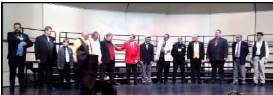
The chorus directors line up prior to presentation of awards.