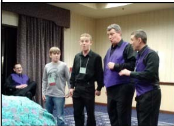
FATHER-SON COALITION entertaining in one of the hospitality rooms.