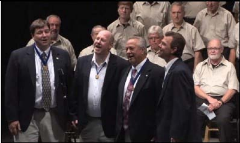
POWER PLAY singing on the TOWN AND COUNTRY CHORUS show in 2012.

[By publication time, Holland will have held its Spring show. Hope that all of this is still true. Editor]