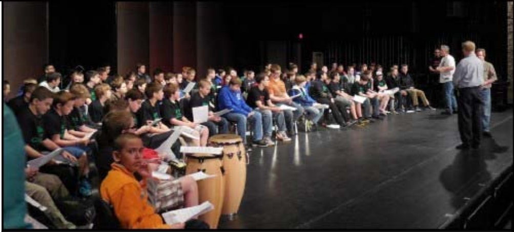
BIG CHIEF CHORUS foursome mentors Milford High School class.