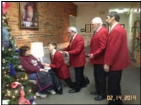
OTHQ delivers a singing valentine.

OTHQ was also chosen to sing at the Sunday morning service at Spring Convention.