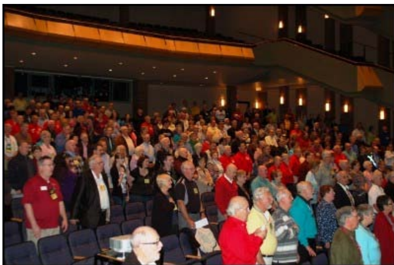
The audience at DeVos Center for Arts and Worship.