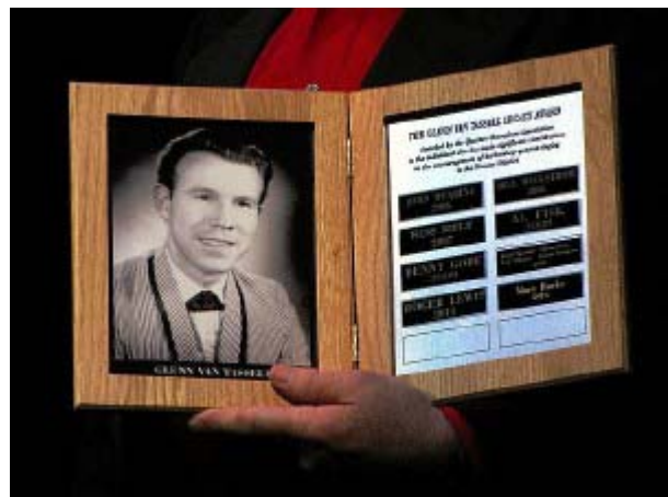
The Glenn Van Tassell award

Following the Quartet Semi-Final Contest Friday night the Grand Rapids GREAT LAKES CHORUS put on a fund-raising show that included the two songs that they will be performing in Portland – "Where the Southern Roses Grow" and "Side by Side."