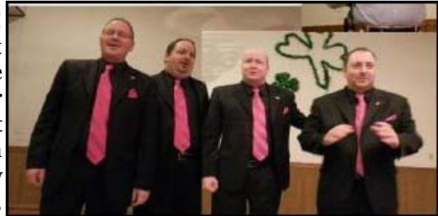
TNS (The Nashville Singers)