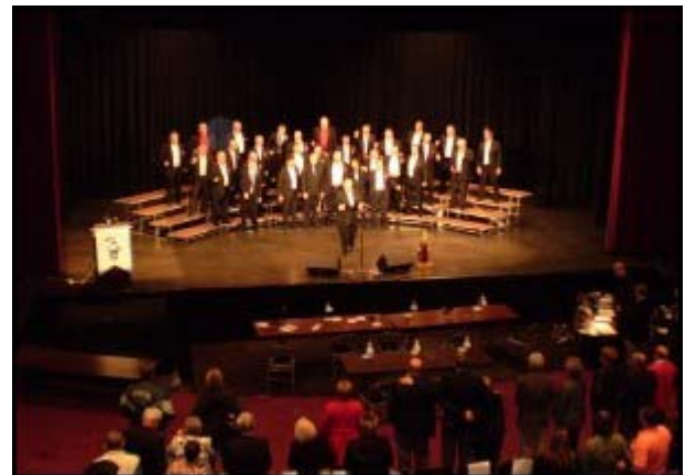
District Champion MountainTown Singers from Mt. Pleasant Chapter

Mt Pleasant 74.9 Detroit-Oakland 71.9 Huron Valley 67.1 Macomb 66.0 Battle Creek 62.8 Lansing 61.2 Flint 60.6 Pontiac-Waterford 60.1 Windsor 57.3 Holland 56.8 Kalamazoo 55.8 Livingston County 54.9 Grosse Point 54.6