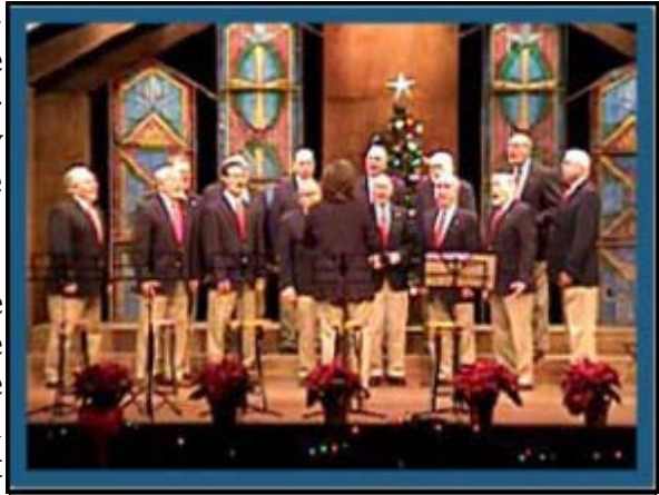
The Harbor Sounds Chorus at the Bay City Players

They have a Reading Theater group called the "Recyclables". They sit on stools and read the script much like old time radio. One has to be at least recyclable age, 55 or older, to be a member. Each year they do a show and call it "A Gift To The Community". There was no charge for the performance.