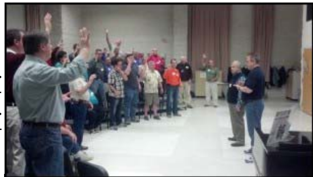
Supercharging Your Chapter!

Numbers are often used to measure success. They are used to compare against a standard or to tally the count of people involved. Numbers are useful, but not the only measure of success.