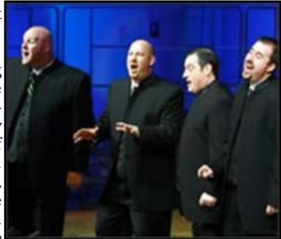
CROSSROADS performance led to three standing Os