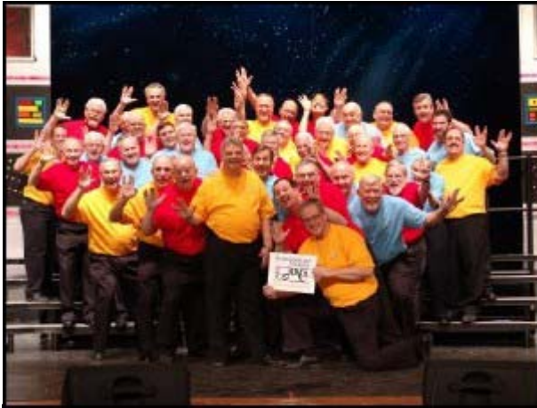
The D.O.C. Chorus in their show costumes