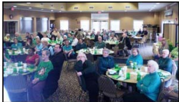
Auburn Hills seniors listen to the Big Chief Chorus