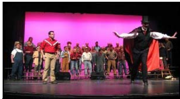
Enter the Villain taking the stage from Beau