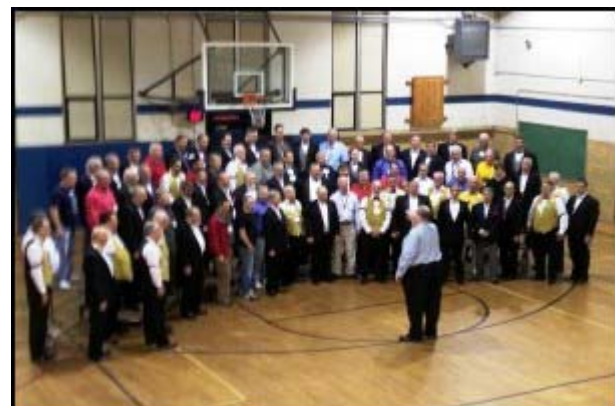
Joe Barbershop Chorus warming up