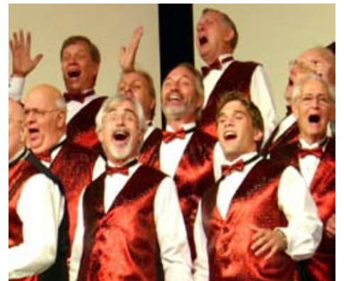
Great Lakes Chorus of Grand Rapids