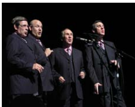
Singing With Dad of Macomb County