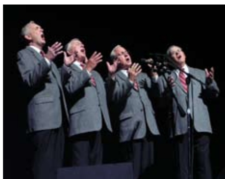
Shades of Grey of Grand Rapids