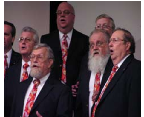
Renaissance Chorus of Wayne