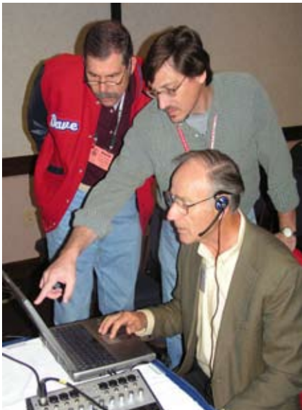
Chordiology audio software class