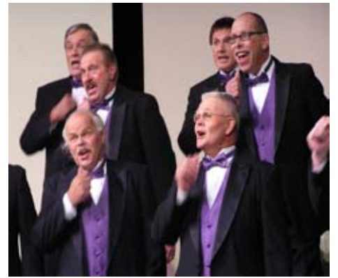
Holland Windmill Chorus of Holland