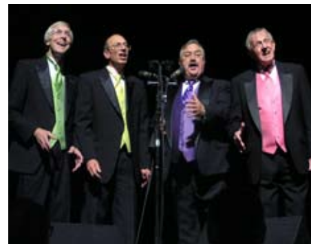
Showtime of Grand Rapids