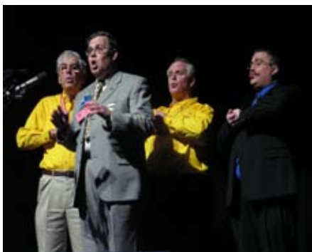
1998 Champs Upstage Sound