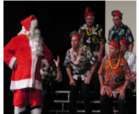
Guardians of Harmony of Macomb County