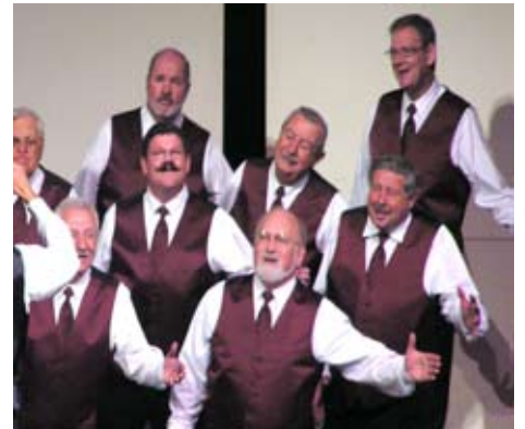
Sun Parlour Chorus of Windsor