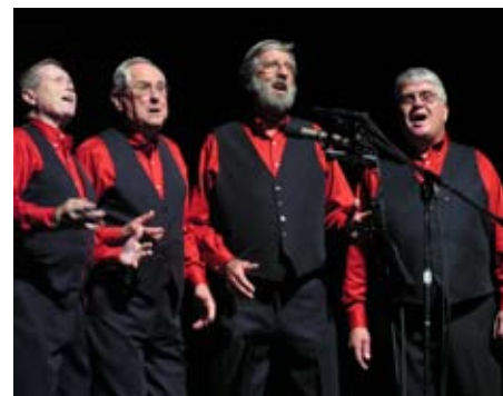
Integrity of Hillsdale