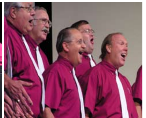
Lighthouse Chorus of Michiana Metro