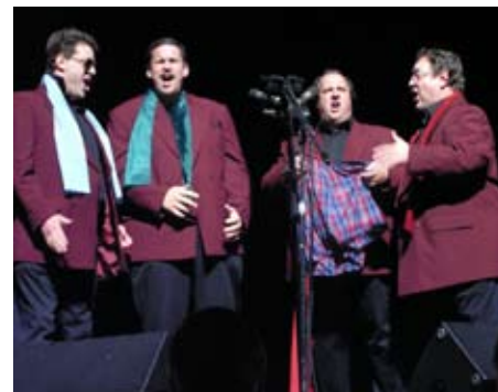
Moxxy of Motor City Metro