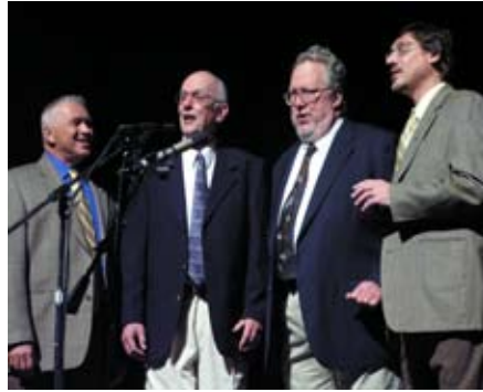
Billchuckology Contest Chordiology