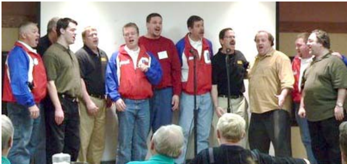
Moxxy Chordiology Something BIG!!