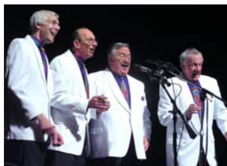
Showtime of Grand Rapids (wild card drawn for Midwinter Convention)