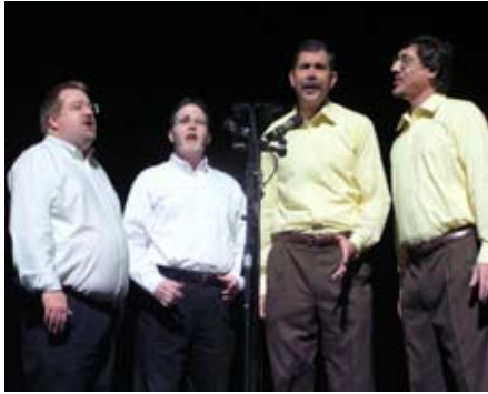
Iaintimology Contest Chordiology