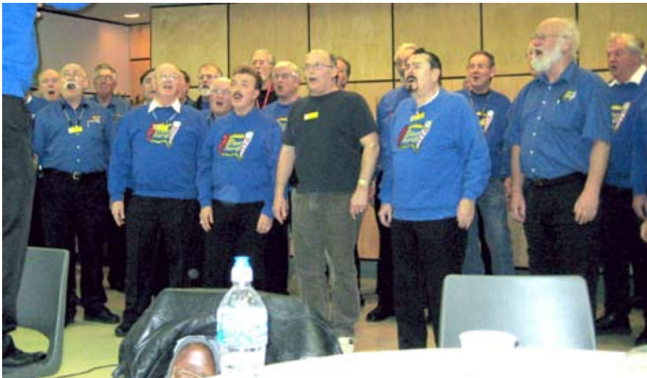
Host chorus The Sun Parlour Chorus of the Windsor Chapter