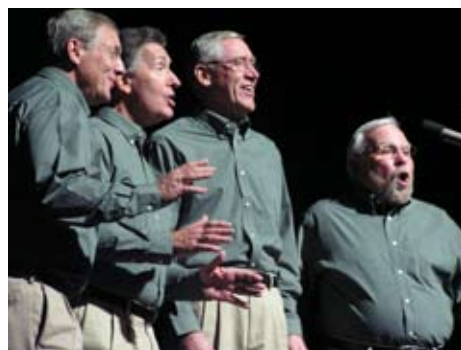
Happy Our of Mt. Pleasant and Traverse City