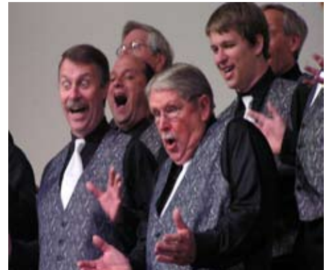
*Valleyaires Chorus of South Bend-Mishawaka IN