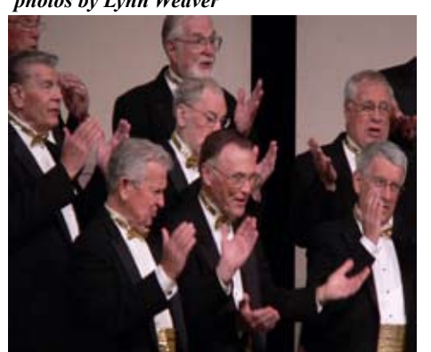
Lakeshore Chorus of Grosse Pointe