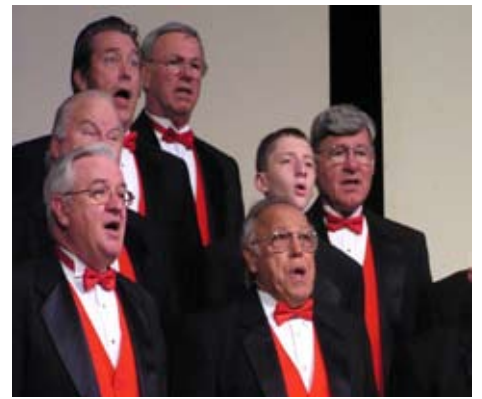
Cereal City Chorus of Battle Creek