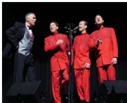
2003 Champs Infinity