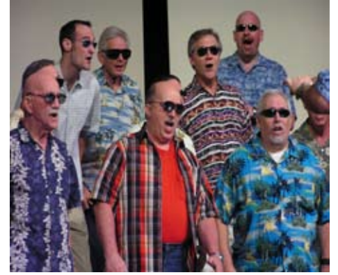
Kalamazoo Barbershop Chorus of Kalamazoo