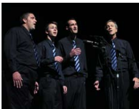
Small Town Sound of Kalamazoo