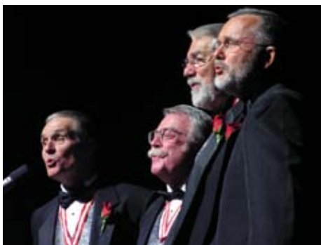
Resisting-A-Rest 2008 Pioneer District International Senior Representatives

*Editor's Correction. In the Summer 2008 print edition of the Troubadour and the online unabridged version, Resisting-A-Rest was announced as having won as 2008 District Senior Quartet International Reps but was actually for the Spring Convention's District Senior Quartet Championship. However, as noted in this article they did still win as the 2008 International Reps at the Fall Convention.