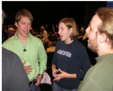
Pick up quartet and QCA Chorus