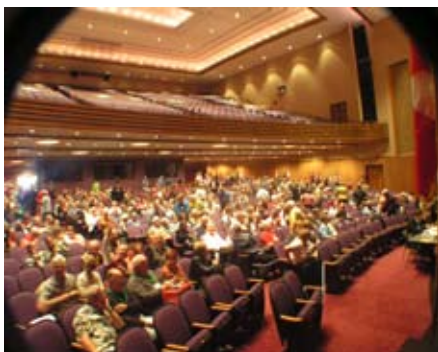
WK Kellogg Auditorium