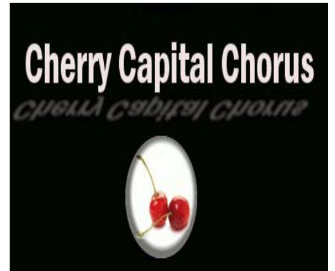
Cherry Capital Chorus of Traverse City