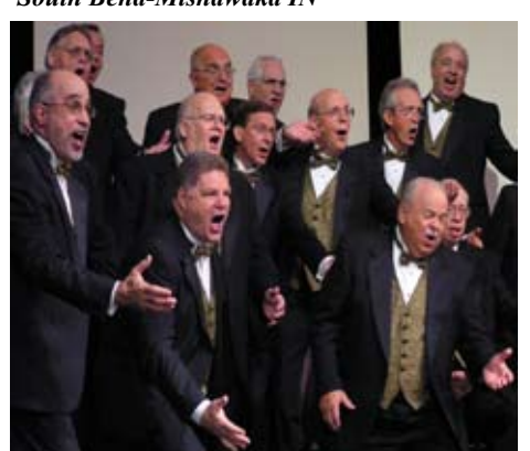
Gentlemen Songsters of Detroit-Oakland