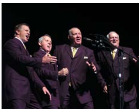
Border Boyz of Hillsdale