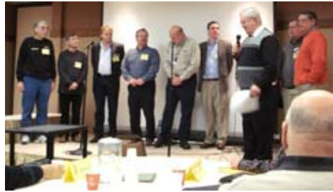
Swearing in of Officers