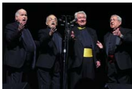
Four To Go of Flint, Macomb County, and Pontiac-Waterford