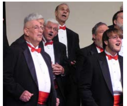
Capitol City Chordsmen of Lansing