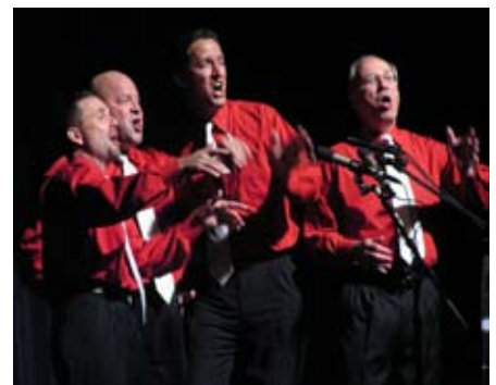
2004 Champs Wildcard