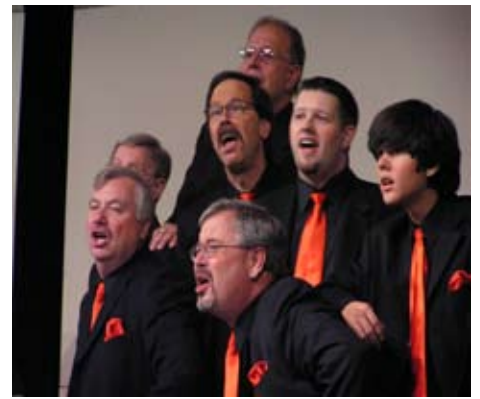
MountainTown Singers of Mt Pleasant