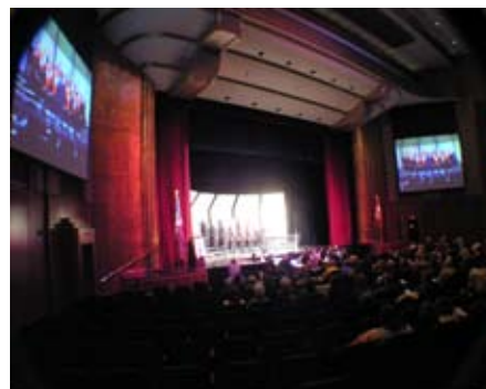
WK Kellogg Auditorium & large tv screens