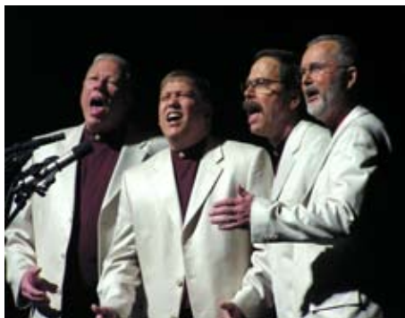
Something Big!! 2008 Pioneer District Quartet Champions