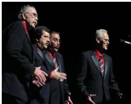
Interstate Chord Company of Michiana Metro, South Bend-Mishawaka IN