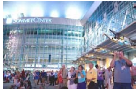
Crowd watching fireworks outside Sommet Center