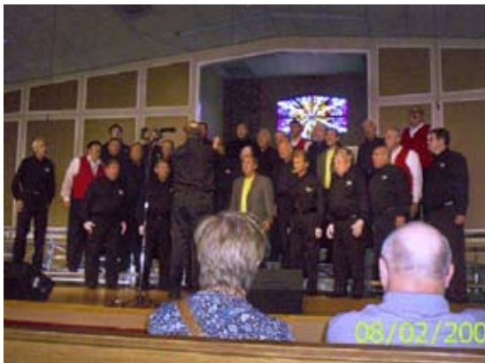
Guardians of Harmony