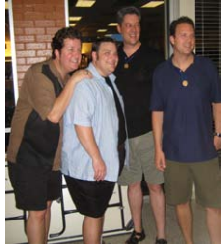
2007 International Champs MaxQ