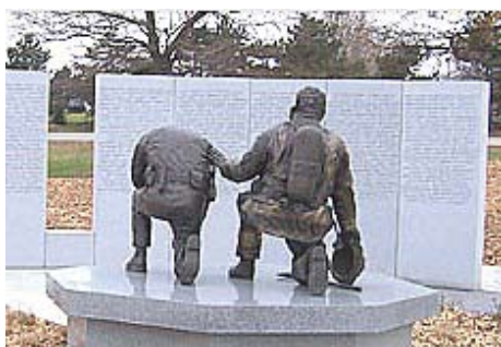
Memorial Wall and Bronze Statues