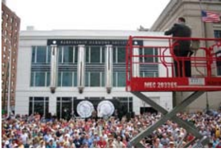
Crowd sings outside new BHS Nashville office- photo by Harmonizer Lorin May