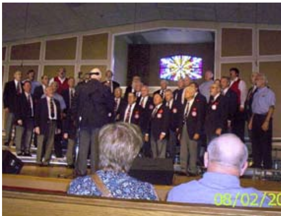
Big Chief Chorus