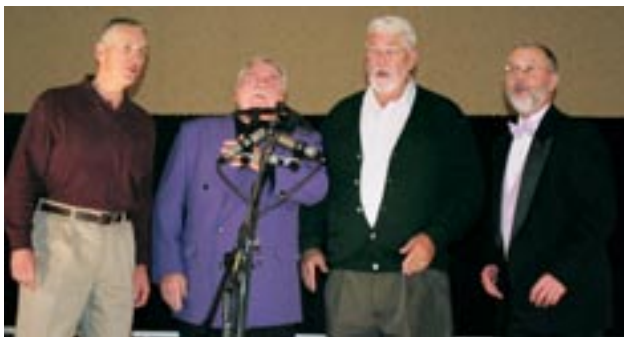
(Top and Middle) Chordiology wins the District Quartet Championship

Above: Resisting-A-Rest won the right to represent Pioneer at Mid-Winter Convention in the Seniors contest (Antiques Roadshow will also go as a wild card. The new quartet scored high enough to have been on track to beat all quartets.