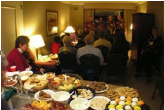
Hospitality: One of the best parts of convention.