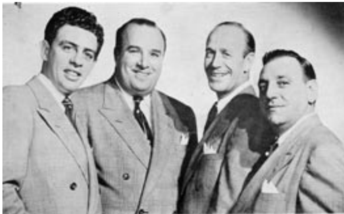
of hearing those robust, resonant