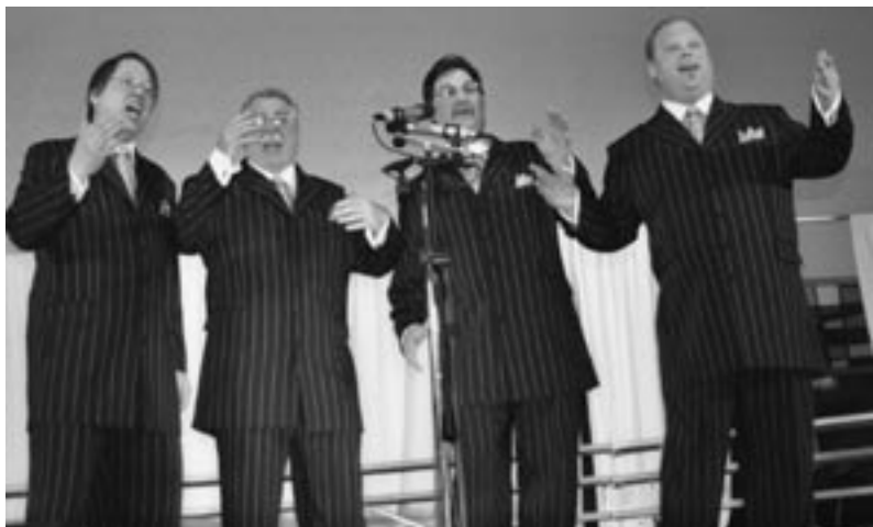
Above: Mount Pleasant wins chorus contest