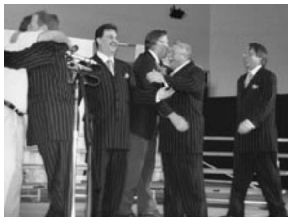
Fermata Nowhere wins and accepts the honor from district officials.