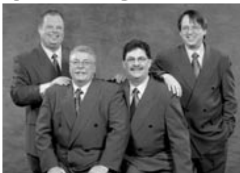
Above: Second place no more. Fermata Nowhere scored far ahead of all competitors, including three quartets that defeated them for championships. Below: In their first contest, Mount Pleasant finished in second. In their second: No. 1.