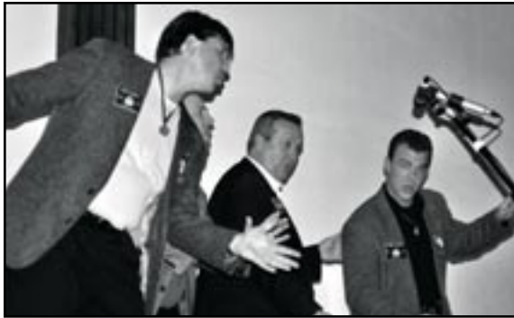
Above: Infinity Left: Power Play The quartets entertained more than 350 people at the Windsor Send-Off Show. For more details, see page 15.