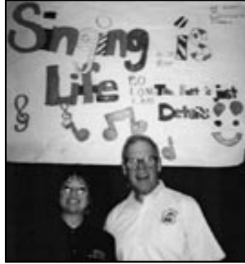
Each chorus sang alone and

then the students joined the chorus in singing "Teach the Children to Sing" for the show finale.