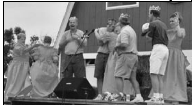
Comedy quartet Novelty Shop "crowning" Power Play July 26..

Afterthought, a rapidly rising quartet out of Indiana, is the current Cardinal District champ and Novelty Shop is a hilarious Sweet Adelines comedy