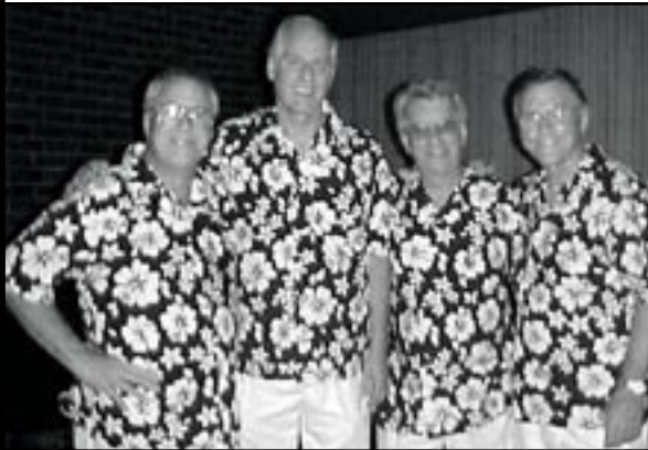
2003 Senior District Champs: In the Neighborhood.