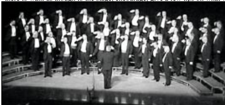
Macomb is going back to International for the second year in a row.

It is unfortunate that for whatever reason, we were the only quartet identified this contest, but I am sure in the future more ways will be found to identify others.