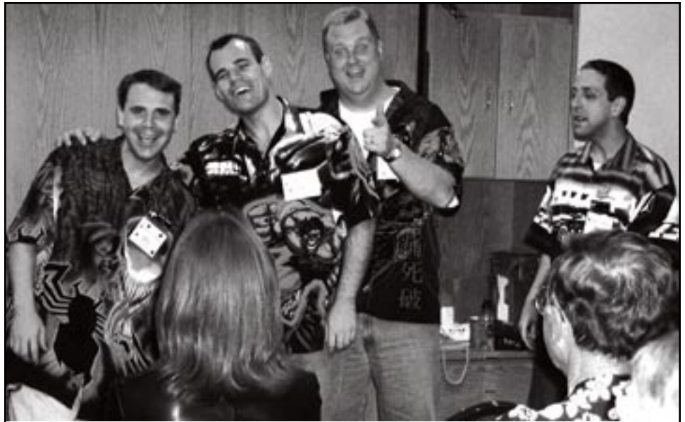
Young men to watch: Party of Four impressed many with a strong second place finish.