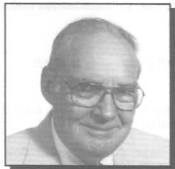
Editor: Gordon Gunn

And your local newspaper will likely grant more ink, more space in print, to your show than anything else you might do, and it is positive exposure. Publicity releases in reference to your show may carry a brief message with your meeting place and time, as well as an invitation. A few well chosen words in display advertising or on show posters might carry the same message.