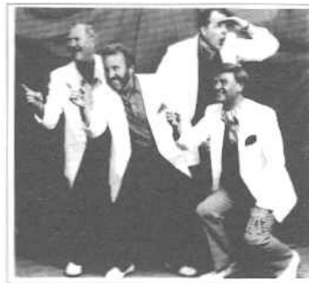
featuring SCHIZO-PHONICS A Hilarious Foursome From Chicago

MATINEE 2:00 p.m. EVENING 8:00 p.m. Whiting Auditorium E. Kearsley Street Flint, Michigan