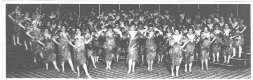
With a Musical Production by the THUMB AREA CHORUS

Advance Sale Ticket Prices: Evening $10.00 Chorus and Guest Quartets Matinee $6.00 Chorus and Chapter Quartets only