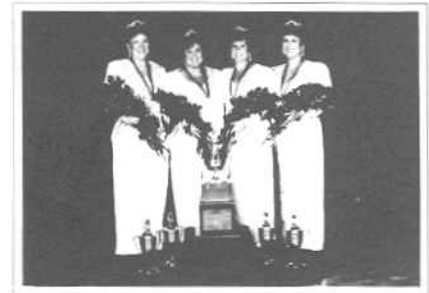
featuring SWING STREET 1991 QUEENS OF HARMONY