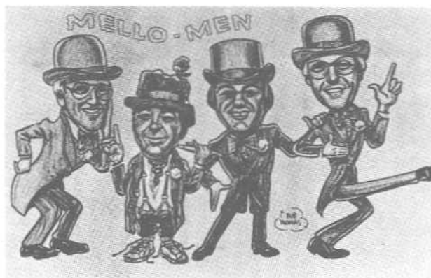
The Mello-Men A Comedy Quartet