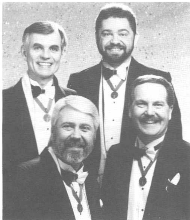
1991 International Quartet Champions