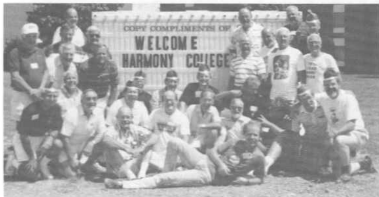
Most of the 29 Pioneer District members at HARMONY College-1991 At Right: The ten DOC members in attendance at the school.