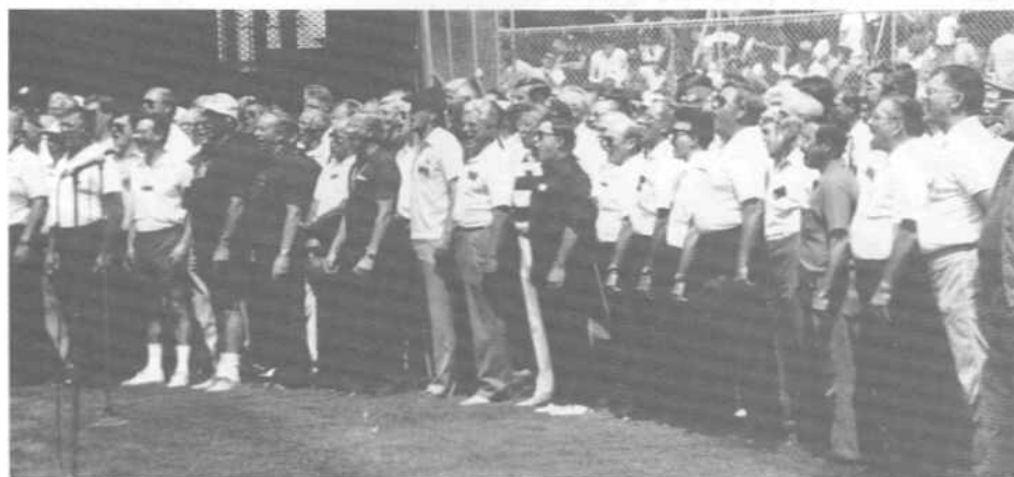
Part of the Pioneer District Barbershoppers singing at the Tiger Ball Game on August 18.