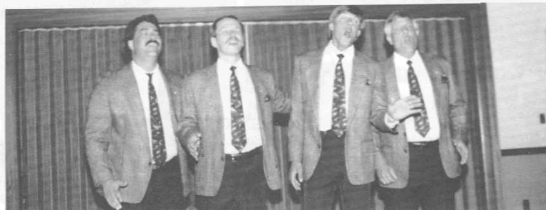
The Illinois District Champs Classic Ring sang up a storm at the school!