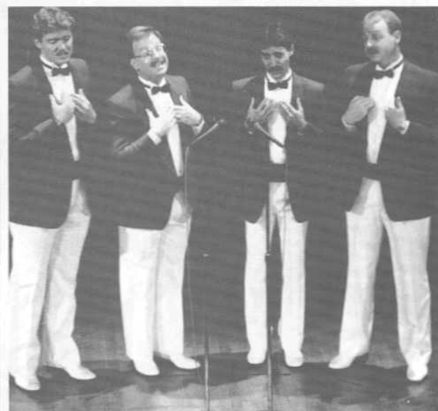
Blue Ribbon Coalition quartet performing at Buckeye Invitational III.