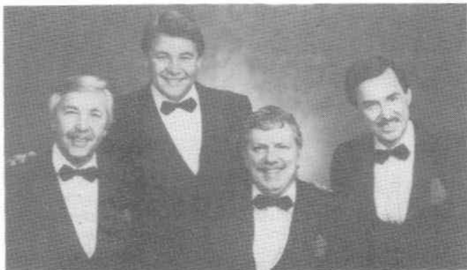
The Gas House Gang