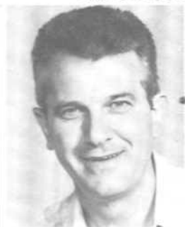
PIONEER LOGOPEDICS CHAIRMAN