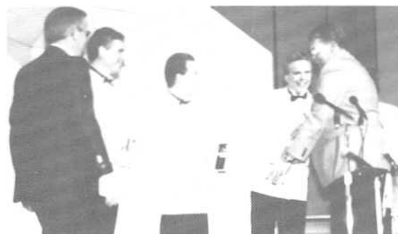
CHECKMATE receiving well earned trophies!