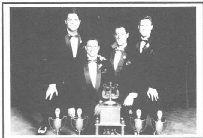
featuring THE ACOUSTIX SPEBSQSA INTERNATIONAL CHAMPIONS from Dallas, Texas