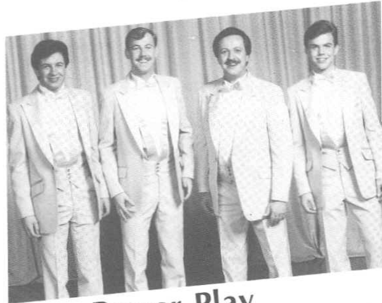
Power Play 1989 Pioneer District Quartet Champs from Macomb County