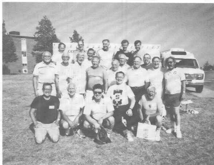
HARMONY COLLEGE, August 1989