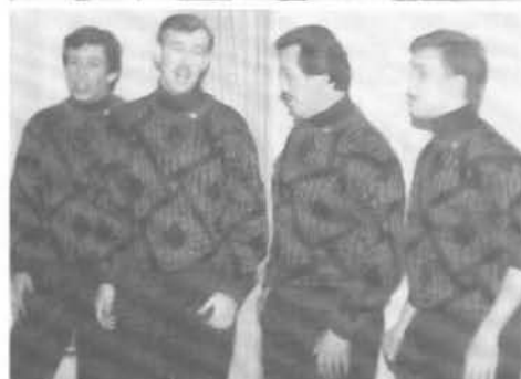
POWER PLAY - OUR NEW CHAMPS! IT WAS THEIR DAY!