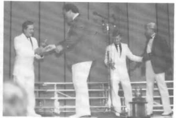
1989 District Quartet Champs POWER PLAY receive trophies from 1988 Champs LEGACY.

Two Sets of Good Used Uniforms for Chorus of 50-55 men