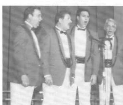
OUR 1988-89 CHAMPS - LEGACY