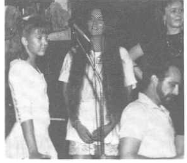
QUARTETS SANG ABOUT THE DELTA AND ABOUT BASEBALL