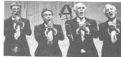
GREAT LAKES CHORUS