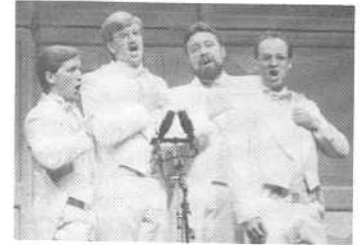
THE IVY LEAGUE