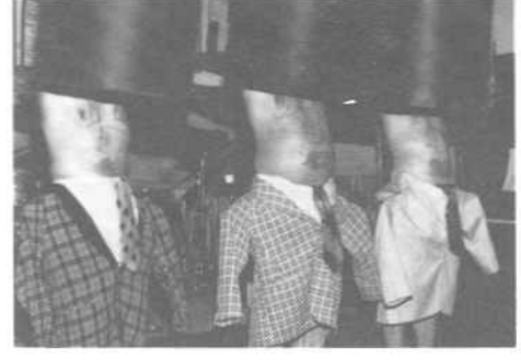
WE HAD A SKIT FROM THE HOLLAND COMMUNITY THEATER AND "ROCK" FROM A ZEELAND HIGH SCHOOL COMBO