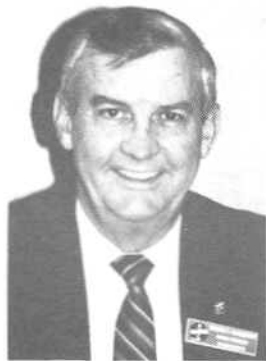
By Your Editor & International Board Member

We seem to be doing all right in the media department lately, as both the Alexandria HARMONIZERS and part of the Detroit/Oakland SONGSTERS appeared on television recently.