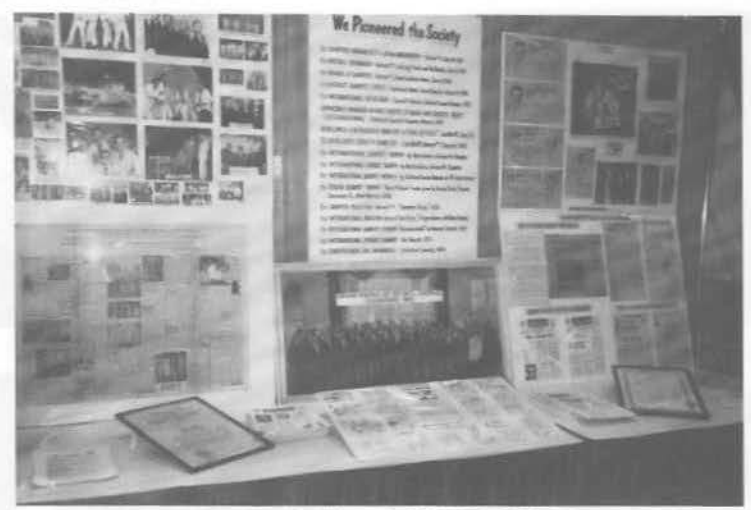
OUR AWARD WINNING PIONEER DISTRICT BOOTH