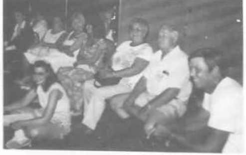
THE GALLERY AT THE REHEARSAL