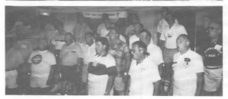
THE GRAND RAPIDS "GREAT LAKES CHORUS" IN REHEARSAL AT THE CROCKETT HOTEL ON WEDNESDAY