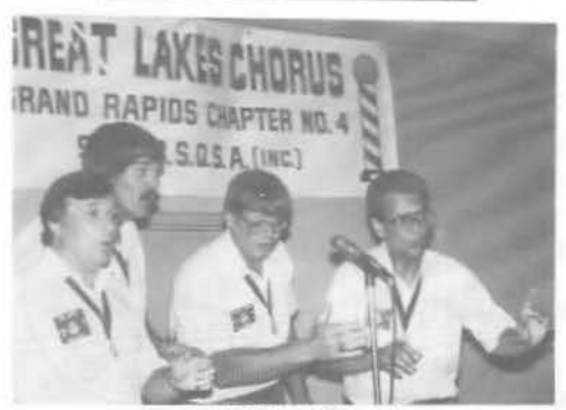
THE RURAL ROUTE 4 1986 INT'L CHAMPIONS