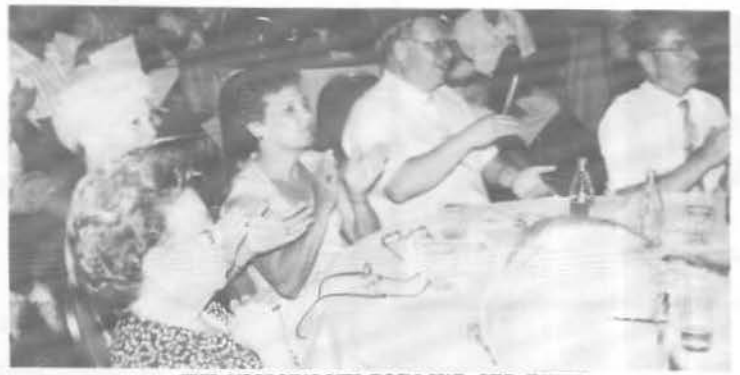
THE HOSPITALITY ROOM HAD ITS FANS!