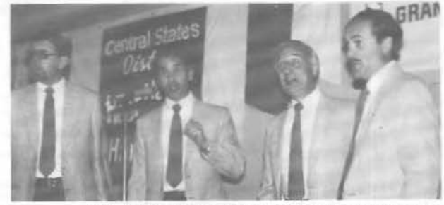
"HI TECH" PERFORMING AT HOSPITALITY ROOM