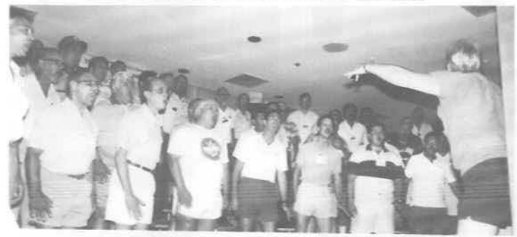
GREAT LAKES CHORUS HARD AT IT IN REHEARSAL