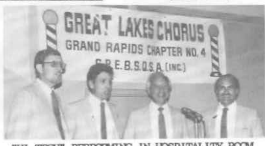
"HI TECH" PERFORMING IN HOSPITALITY ROOM