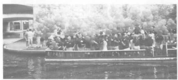
NARRAGANSETT BAY CHORUS CHAPTER ON BOAT