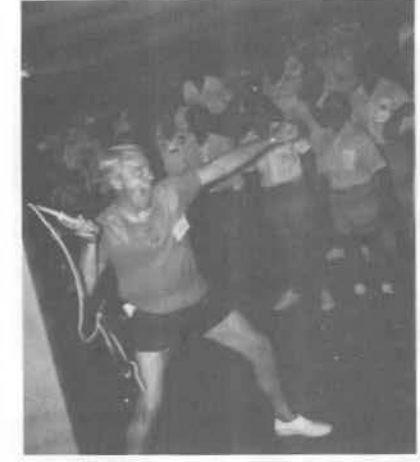
"I HEARD THAT BAD CHORD, JONES!"