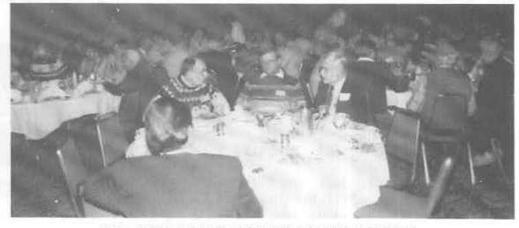
YOU CAN SEE WHO ARE THE "CHOW HOUNDS!"