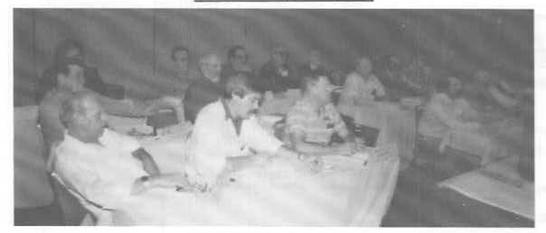
PROGRAM VICE PRESIDENTS