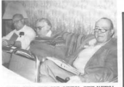
THESE GUYS ARE COT SCHOOL RECLINERS!