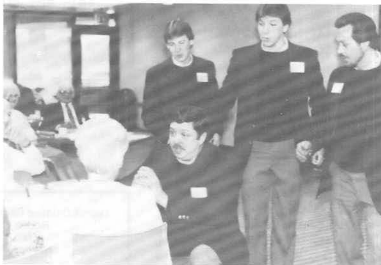
THE FAMILY FORUM

The entertainment included their annual Logopedic's auction which is always a highlight. Small gifts were exchanged among the participants, followed by a delicious potluck meal which tickled the palates of everyone present. It turned out to be a fine time for everyone in attendance.