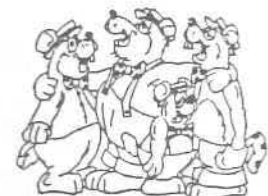
A GOOD CHORD BEARS REPEATING!