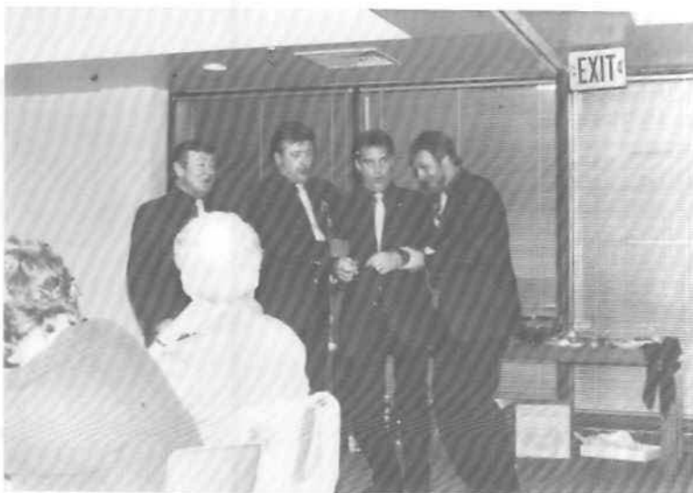
THE ENTERTAINMENT EXPRESS