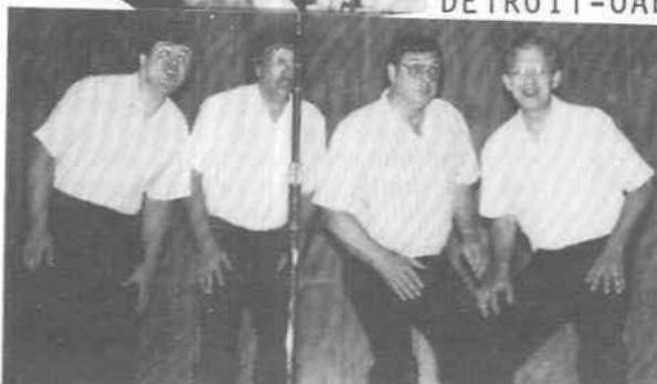
4 PART FORMULA