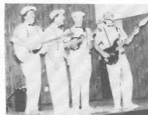
HERE COMES TREBLE