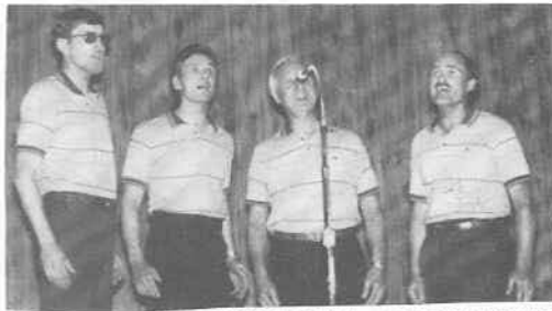
HIGH TECH MUSICAL CIRCUITRY