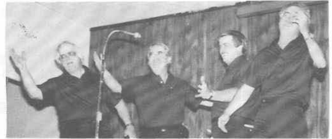
THE VERY IDEA