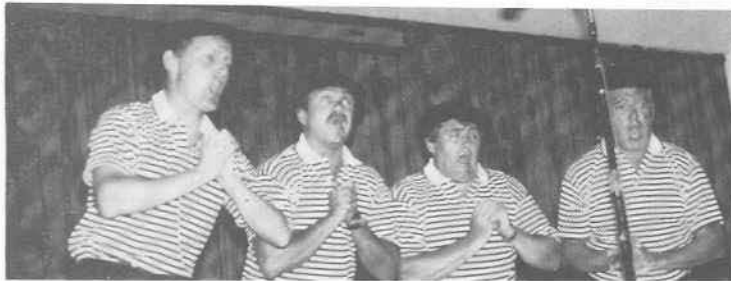
TIME WILL TELL