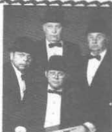
Gay 90's Quartet