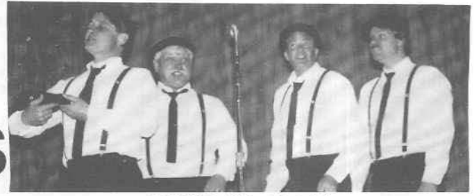
TOUCH OF CLASH