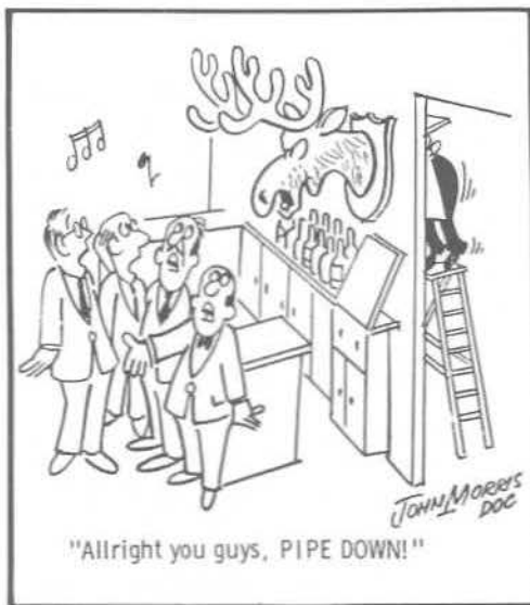
"Allright you guys, PIPE DOWN!"

Last, but not least---chapter presidents, if your chapter has not had a visit from an area counselor or division vice president, don't wait for him to show up. Call him, and invite him to your next meeting.