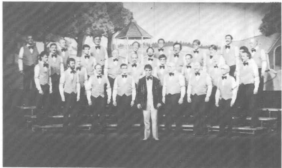
The Cherry Capitol Chorus