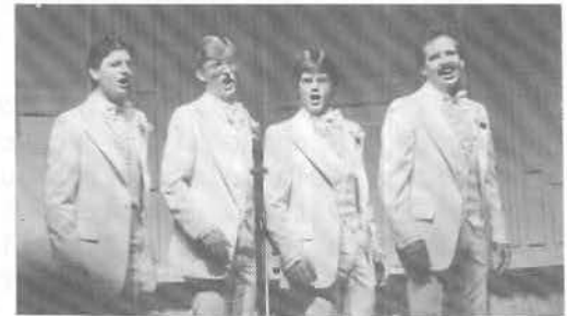
SATURDAY NITE FEATURE