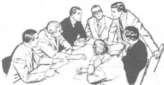
PIONEER DISTRICT BOARD OF DIRECTOR'S MEETING Eastern Michigan University, Ypsilanti, Michigan December 5, 1981