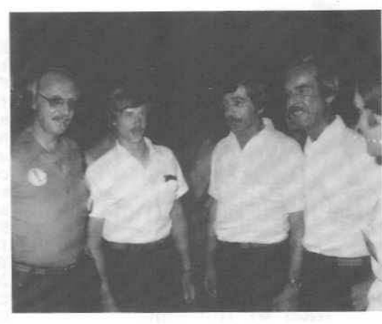
PHOTO MEMORIES OF THE 43RD ANNUAL BARBERSHOP INTERNATIONAL CONVENTION DETROIT, MICHIGAN.