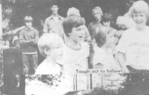
Tough act to follow!