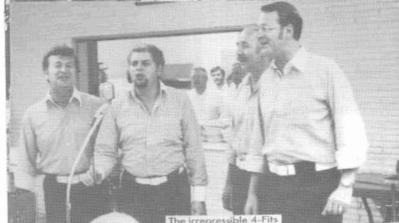
The irrepressible 4-Fits