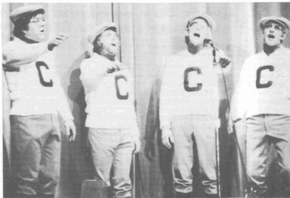
THE CLASSMATES —New District Champs