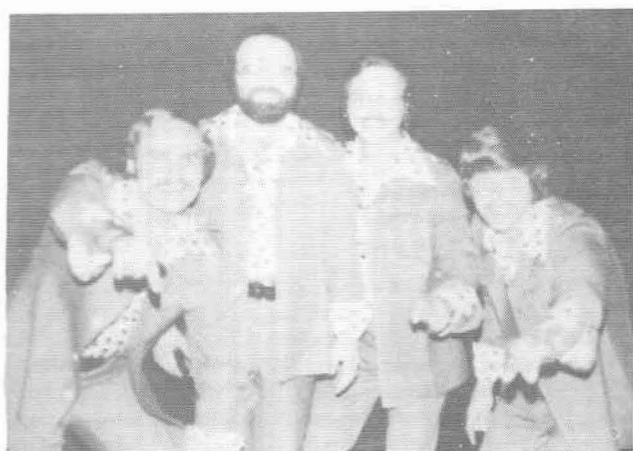
THE SOUND SPECTRUM

Other scores and the finishing order can be found in the scoring summaries in this issue.