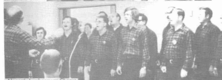
Alpena's Lumbermens Chorus