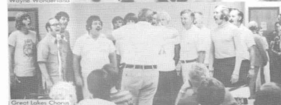
Great Lakes Chorus