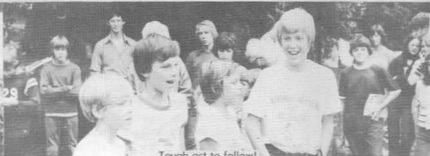
Tough act to follow!