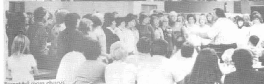
SweetAd mass chorus