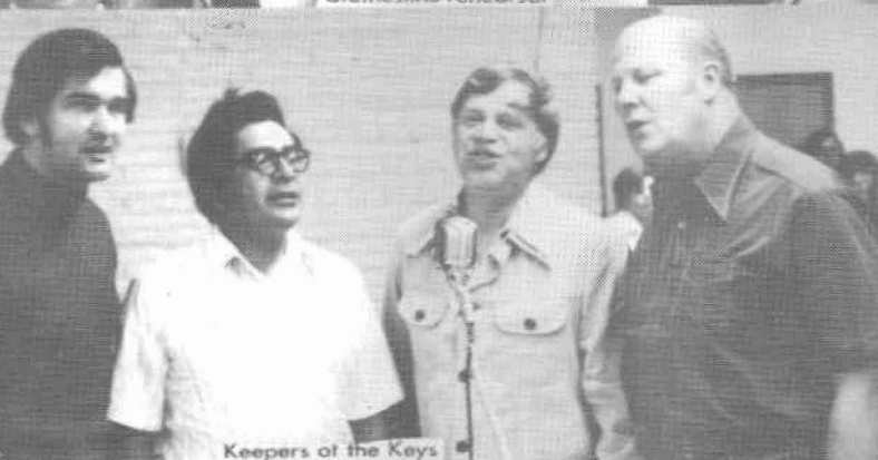
Keepers of the Keys