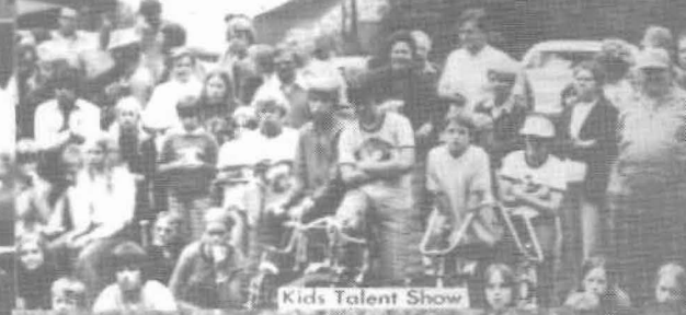
Kids Talent Show