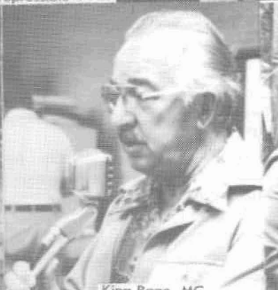
King Page, MC