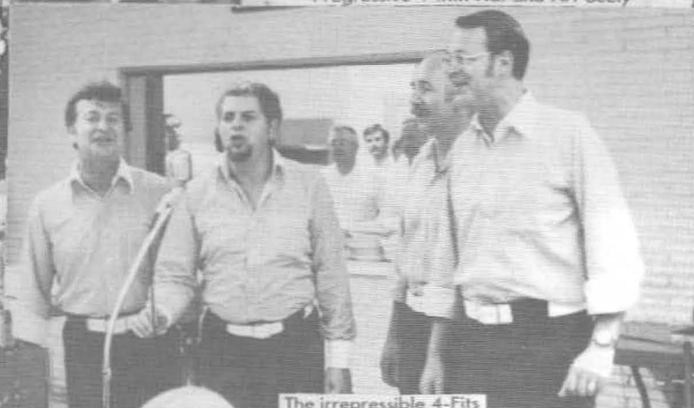
The irrepressible 4-Fits