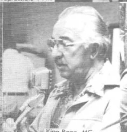
King Page, MC