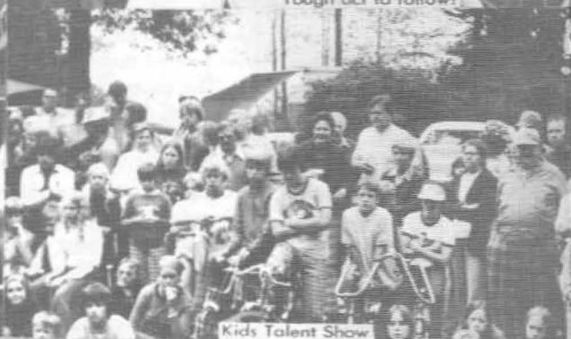
Kids Talent Show