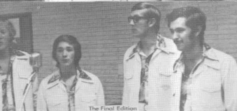
The Final Edition