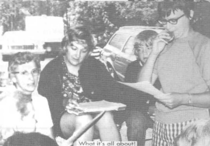
What it's all about!