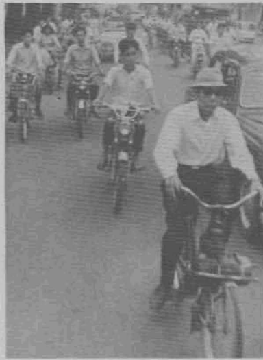
TYPICAL CONSTANT TRAFFIC SCENE IN SAIGON