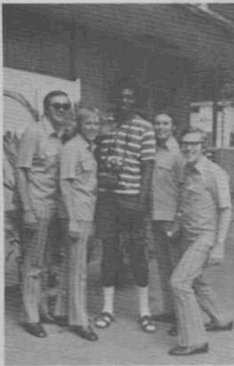
BOB LOVE OF THE N.B.A. CHICAGO BULLS. A GROUP OF BASKETBALL PLAYERS WERE THERE ON TOUR.