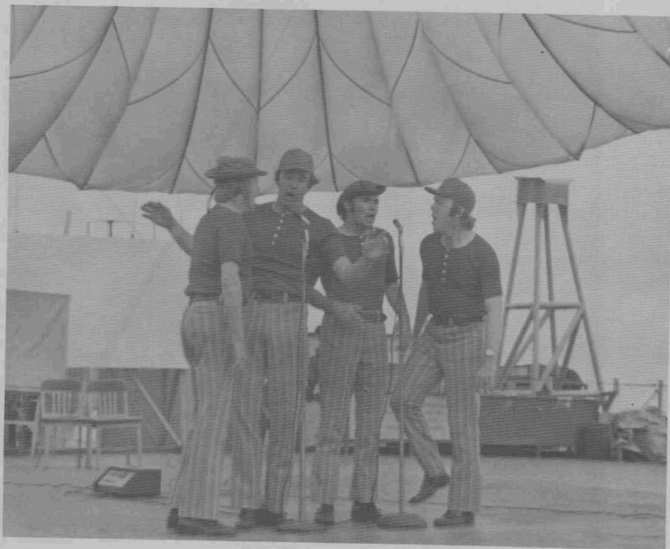
PERFORMANCE ON FANTAIL OF THE SHIP CORPUS CHRISTI. AUDIENCE OF 125 GUYS. THIS IS THE ONLY SHIP IN THE ARMY. IT'S USED AS A HELICOPTOR REPAIR BASE AND IS MANNED BY ONLY ARMY PERSONEL.

Imagine it! One week we were crowned INTERNATIONAL CHAMPIONS of the world's greatest singing society, and the next week we were on our way to the other side of the world.