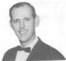
DICK VAN DYKE