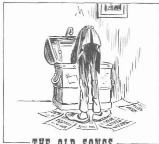
THE OLD SONGS

"I could take columns telling about this convention. I was asked to be Master of Ceremonies at one of the big songfests. Like a bolt from the blue, I was scared to death, but very proud. Lots of audience, but all just plain home folks, who like to sing and to listen. Especially when it's so doggone American. It's the songs that get you. They're so thoroughly American. With the passing of the years, they've become the folk songs of our people, the song tradition of our land."