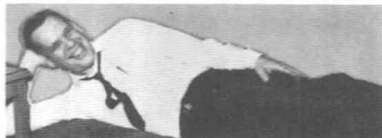
Off The Davenport

POSTMAN: MAIL ADDRESS CHANGES AND UNDELIVERABLE COPIES TO THE OFFICE OF PUBLICATION: THE NORTHVILLE RECORD, NORTHVILLE, MICHIGAN 48167