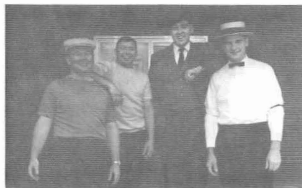
BEAN TOWN FOUR