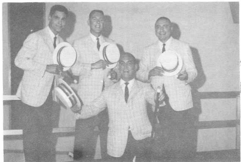
THE LAST STRAWS

4th Place--International Illinois District