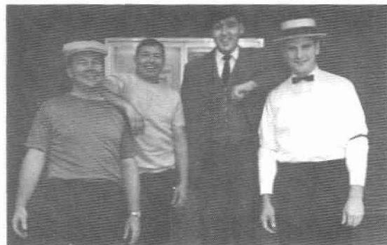
BEAN TOWN FOUR