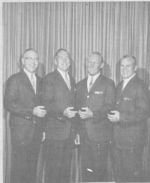
BUCKSTERS — BUCHANAN

Pictures of other competing quartets not available.