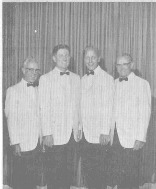
NOTE ABLE FOUR