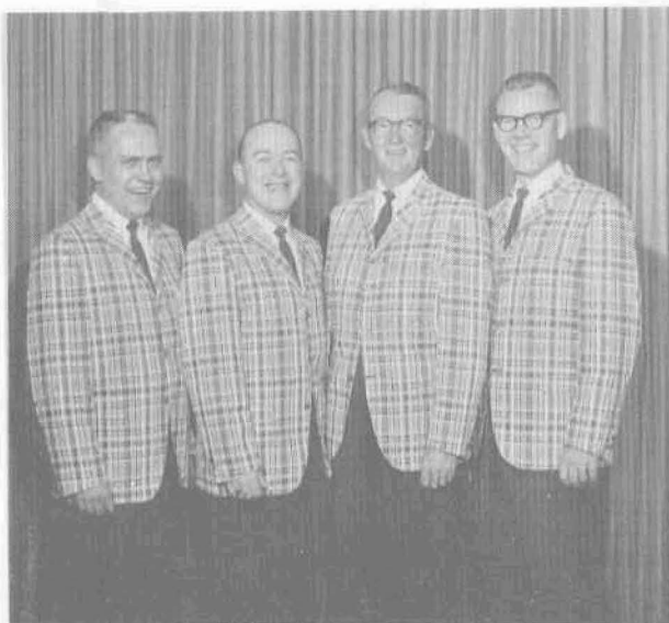
OCCASIONAL FOUR — MUSKEGON