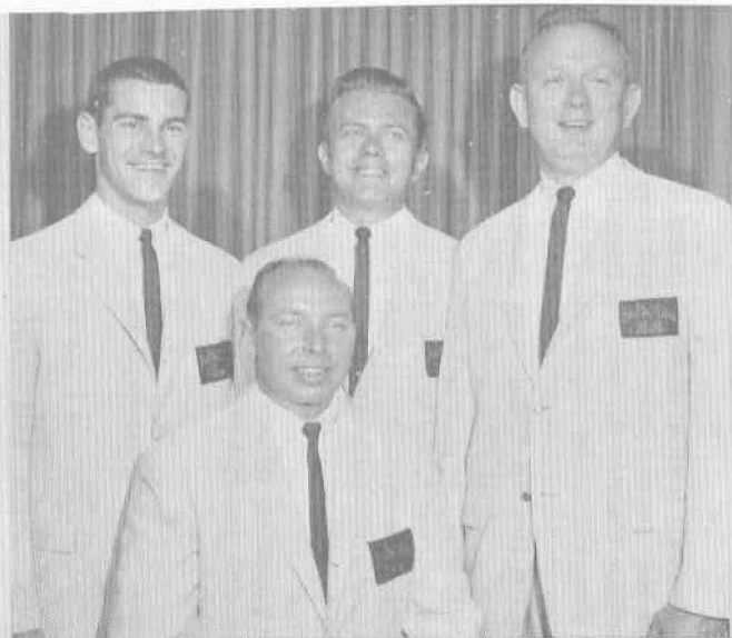
DELTA AIRES — FLINT