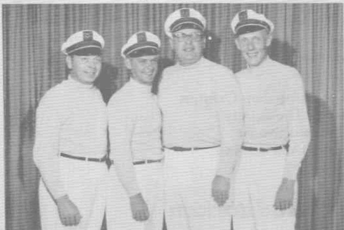
FOREMASTERS — MUSKEGON