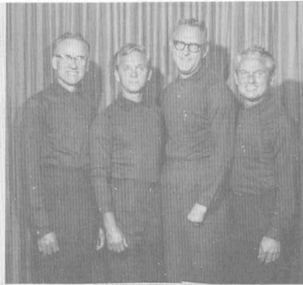
QUADRI-CHORDS — BENTON HARBOR