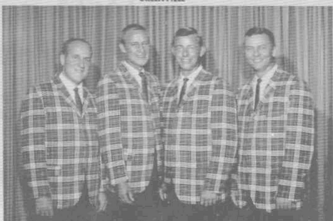
ESPRIT DE CHORDS — UTICA ROCHESTER