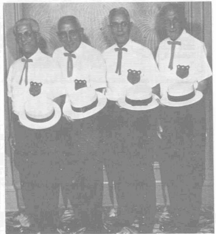
19th CENTURY FOUR