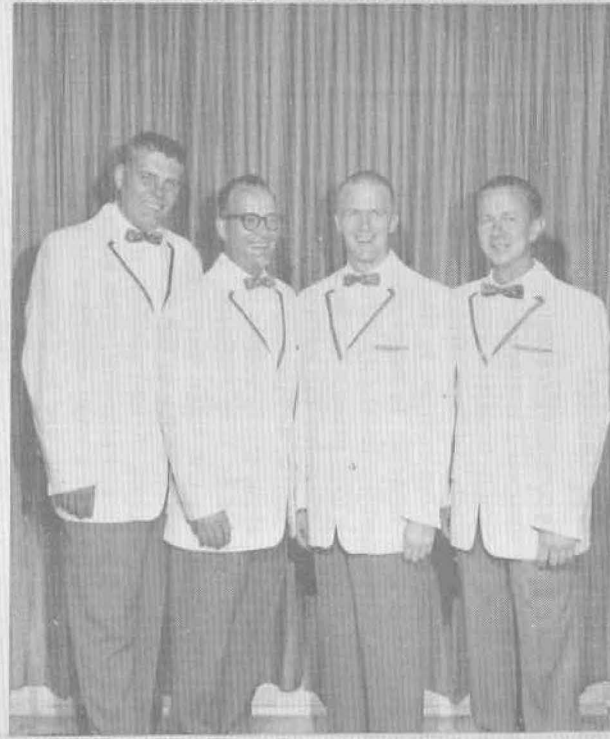
STAFFMEN — HOLLAND

Pictures of other competing quartets not available.